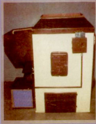
A-120 Right Hand Model